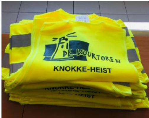
Fluo -hesjes – safety for the kids