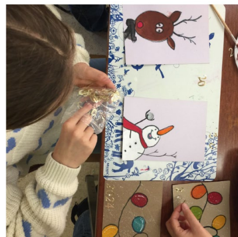
Above: creative class